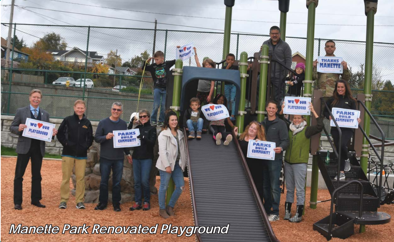
Manette Park Renovated Playground