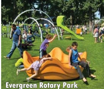
Evergreen Rotary Park