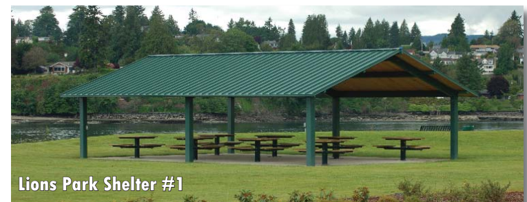
Lions Park Shelter #1

Park & Shelter Reservations: A permit is required to reserve an athletic field, shelter, a park or portion of a park for larger group gatherings. Use permits prevent conflicts, make necessary preparations, prepare facilities and avoid over use. Reservation forms are available at www.bremertonwa.gov or at the Bremerton Parks & Recreation Administrative Office located at 680 Lebo Blvd., Bremerton, WA 98310. All reservations are first come, first served. Questions? Phone (360) 473-5305 or fax (360) 473-5882.