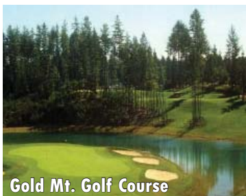
Gold Mt. Golf Course