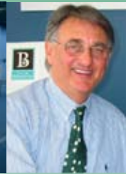
Mayor Cary Bozeman